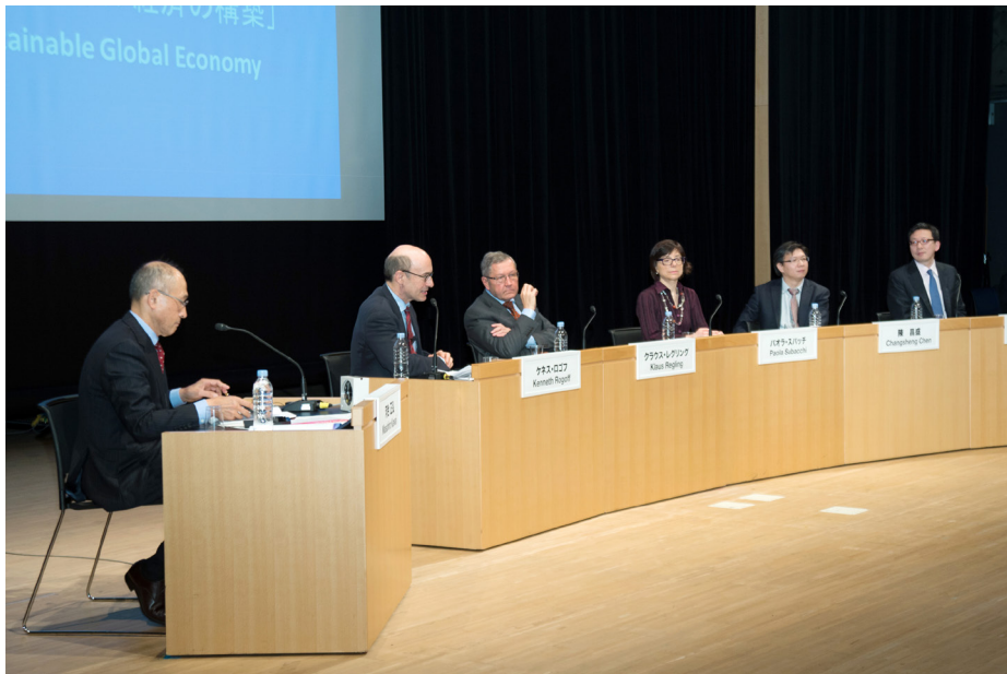
Panel Discussion at the 2015 Forum

In the macro economy area, the Foundation has organized conferences together with experts from the Brookings Institution (US), Chatham House (UK), the Development Research Center of the State Council (China), and Bruegel (Belgium) as well as Nomura Securities and Nomura Institute of Capital Markets Research to share research on such topics as monetary and financial institutions, fiscal stability, and demographic change and sustainability.