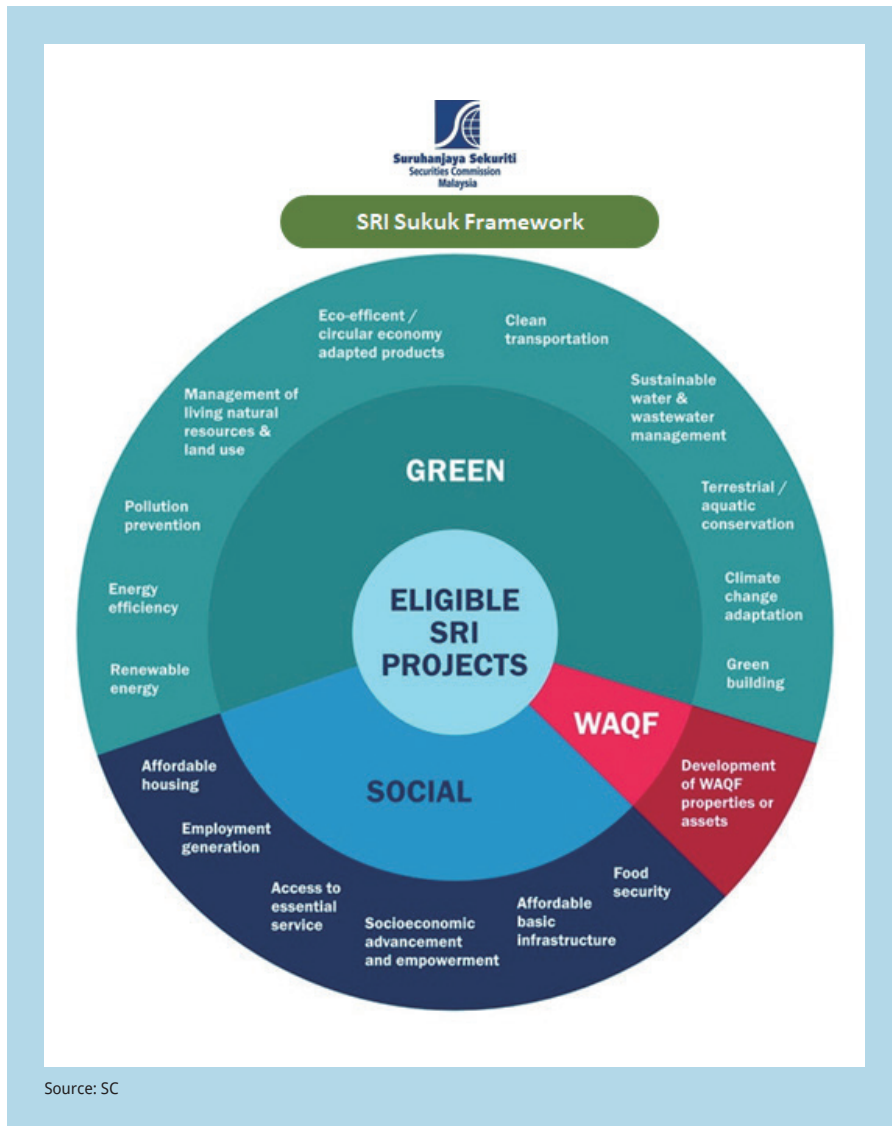
Figure 2: SRI Sukuk Framework Summary