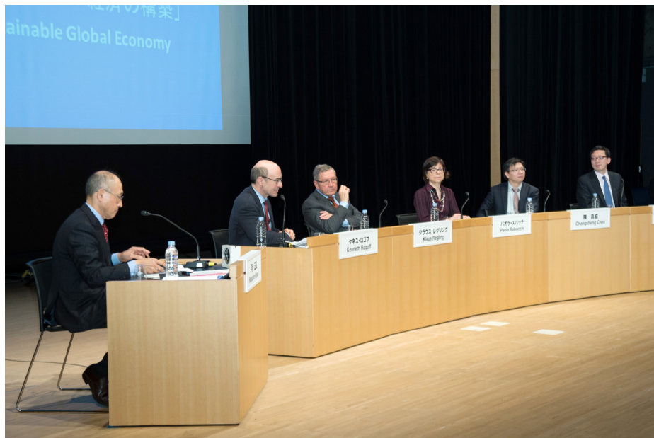
Panel Discussion at the 2015 Forum

In the area of capital markets, the Foundation has organized conferences