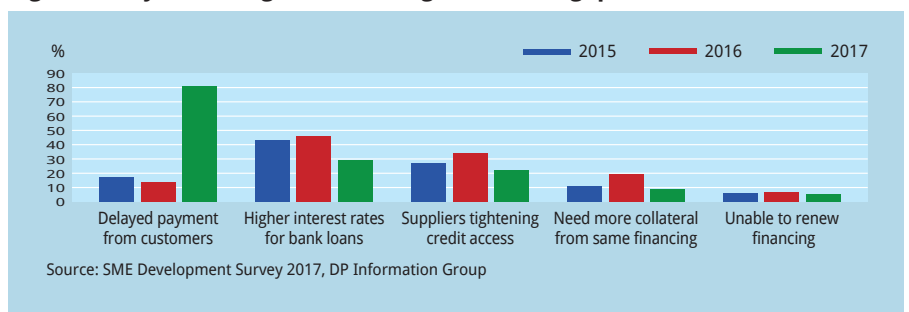
Figure 2: Key Financing Issues Facing SMEs in Singapore

The SME Development Survey 2017 found that 35% of companies surveyed faced financing issues, up 13% year-onyear, and at the highest level since the survey began tracking this challenge in 2011. Among the financing issues SMEs faced, all categories showed improving trends with the exception of delayed payment from customers, which increased nearly six times from 14% in 2016 to 81% in 2017 (Figure 2).