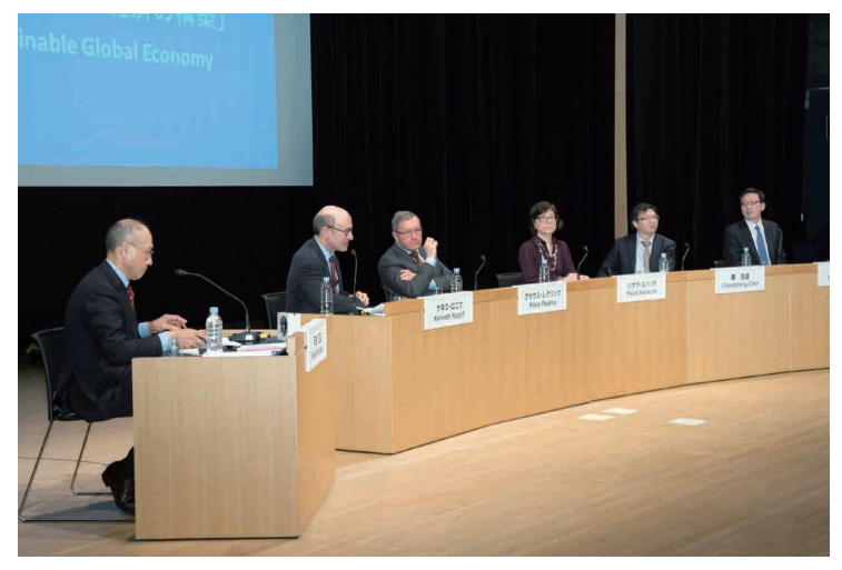
Panel Discussion at the 2015 Forum

The World Economy program carries on the work of the former Tokyo Club Foundation for Global Studies in funding research, conferences, and publications on the global macro economy and capital market development.