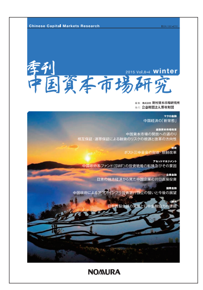
Cover of Chinese Capital Markets Research