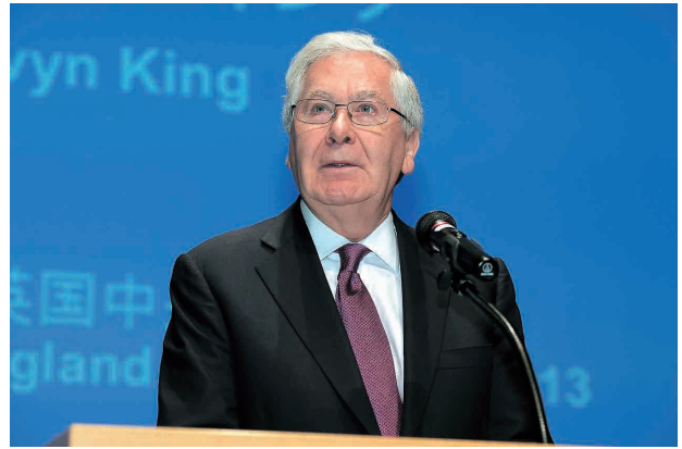
Lord Mervyn King at the 2015 Forum