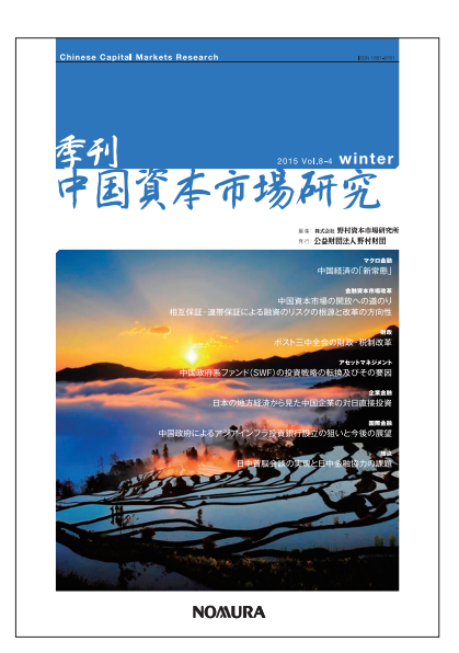
Cover of Chinese Capital Markets Research

With the expanding importance of Asia in the 21st century global economy, the Foundation has been increasing its support of intellectual interactions among experts at think tanks, universities and government agencies in the region. As part of this effort and recognizing the importance of capital market development in promoting economic growth and prosperity in Asian countries, the Foundation started publishing Nomura Journal of Asian Capital Markets in 2016.