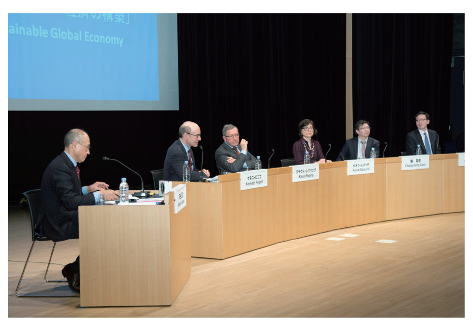
Panel Discussion at the 2015 Forum

In the macro economy area, the Foundation has organized conferences together with experts from the Brookings Institution (US), Chatham House (UK), the Development Research Center of the State Council (China), and Bruegel (Belgium) as well as Nomura Securities and Nomura Institute of Capital Markets Research to share research on such topics as monetary and financial institutions, fiscal stability, and demographic change and sustainability.