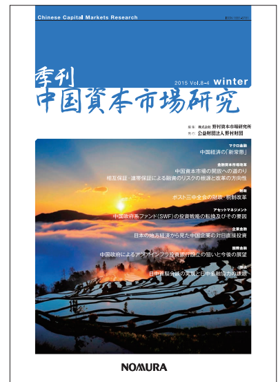
Cover of Chinese Capital Markets Research

With the expanding importance of Asia in the 21 st century global economy, the Foundation has been increasing its support of intellectual interactions among experts at think tanks, universities and government agencies in the region. As part of this effort and recognizing the importance of capital market development in promoting economic growth and prosperity in Asian countries, the Foundation started publishing Nomura Journal of Asian Capital Markets in 2016.