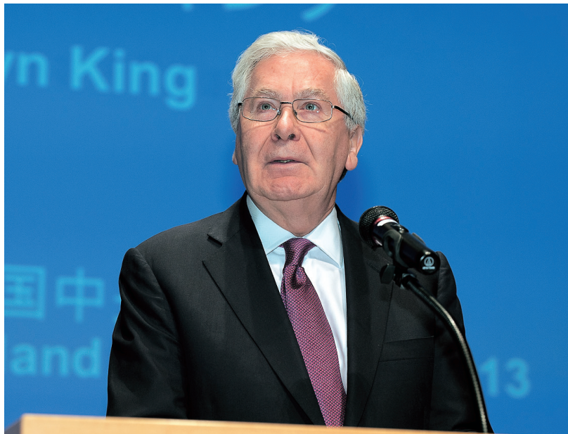
Lord Mervyn King at the 2015 Forum