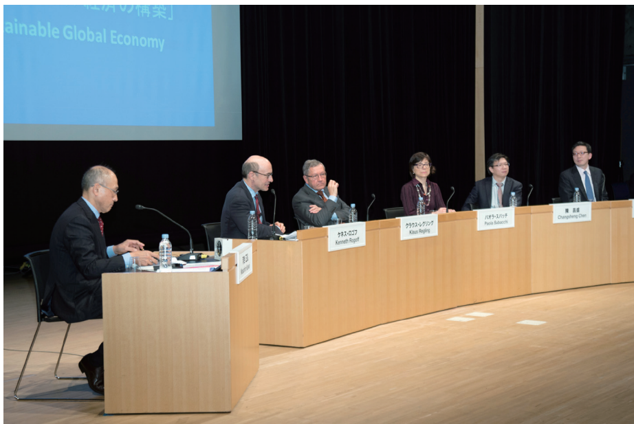
Panel Discussion at the 2015 Forum

In the macro economy area, the Foundation has organized conferences together with experts from the Brookings Institution (US), Chatham House (UK), the Development Research Center of the State Council (China), and Bruegel (Belgium) as well as Nomura Securities and Nomura Institute of Capital Markets Research to share research on such topics as monetary and financial institutions, fiscal stability, and demographic change and sustainability.