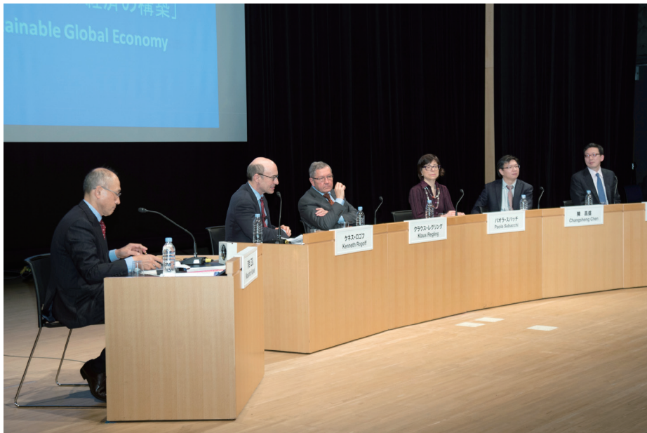
Panel Discussion at the 2015 Forum

In the macro economy area, the Foundation has organized conferences together with experts from the Brookings Institution (US), Chatham House (UK), the Development Research Center of the State Council (China), and Bruegel (Belgium) as well as Nomura Securities and Nomura Institute of Capital Markets Research to share research on such topics as monetary and financial institutions, fiscal stability, and demographic change and sustainability.