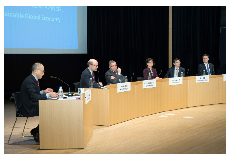
Panel Discussion at the 2015 Forum

In the macro economy area, the Foundation has organized conferences together with experts from the Brookings Institution (US), Chatham House (UK), the Development Research Center of the State Council (China), and Bruegel (Belgium) as well as Nomura Securities and Nomura Institute of Capital Markets Research to share research on such topics as monetary and financial institutions, fiscal stability, and demographic change and sustainability.