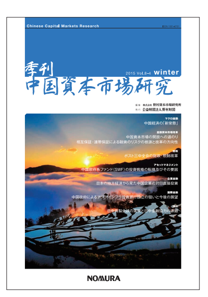
Cover of Chinese Capital Markets Research

With the expanding importance of Asia in the 21st century global economy, the Foundation has been increasing its support of intellectual interactions among experts at think tanks, universities and government agencies in the region. As part of this effort and recognizing the importance of capital market development in promoting economic growth and prosperity in Asian countries, the Foundation started publishing Nomura Journal of Asian Capital Markets in 2016.