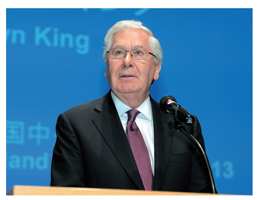
Lord Mervyn King at the 2015 Forum