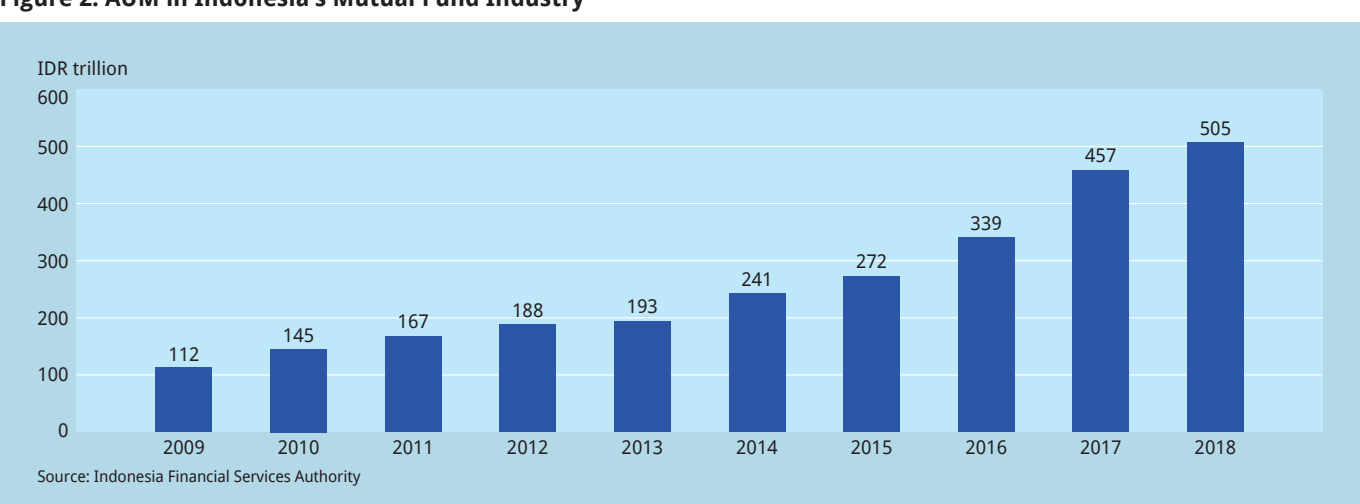
Figure 2: AUM in Indonesia's Mutual Fund Industry

For alternative investments such as real estate investment trusts (REITs) and Infrastructure funds, the management fee is around 50-100bps. However, the number of listed REITs and infrastructure funds is still limited even though the opportunity is very huge. The regulator aims to develop this asset class by aligning with the government's program to finance Indonesia's infrastructure development. The government requires private sector funding to help finance a huge amount of infrastructure development. One way to attract investors is through the issuance of alternative investments such as municipal bonds, REITs, and infrastructure funds. The government issued a regulation that requires financial institutions such as pension funds, insurance, and social/health security funds to invest in alternative products that invest in government infrastructure projects. The industry believes that alternative investments, private asset and infrastructure funds will be an important growth area. One of the key features of mutual funds in Indonesia that is attractive for investors is that their return is net of tax, as it is already taxed at the fund level. This creates the opportunity to structure a product for tax efficiency purposes by securitizing assets under mutual