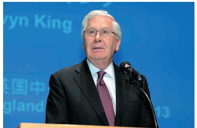
Lord Mervyn King at the 2015 Forum