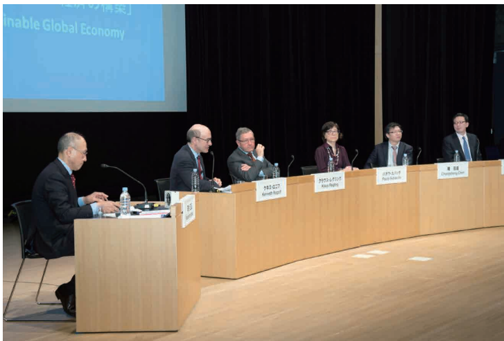
Panel Discussion at the 2015 Forum

The World Economy program carries on the work of the former Tokyo Club Foundation for Global Studies in funding research, conferences, and publications on the global macro economy and capital market development.