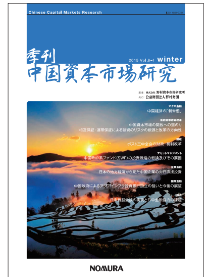
Cover of Chinese Capital Markets Research