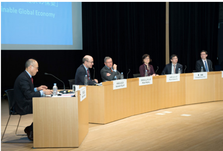
Panel Discussion at the 2015 Forum

The World Economy program carries on the work of the former Tokyo Club Foundation for Global Studies in funding research, conferences, and publications on the global macro economy and capital market development.