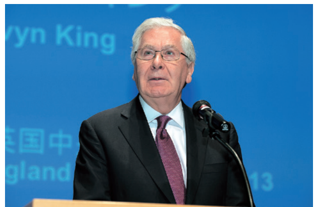
Lord Mervyn King at the 2015 Forum