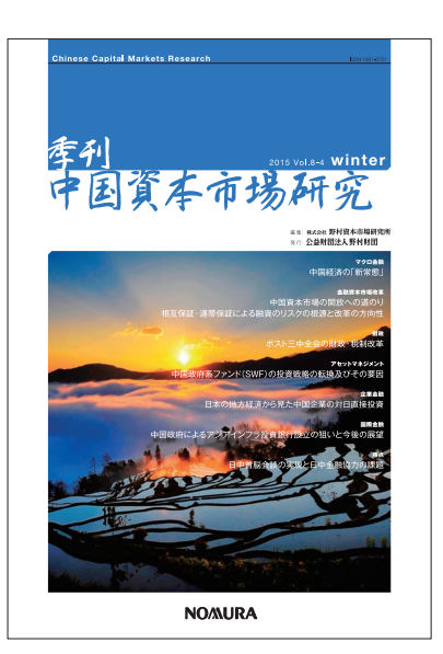
Cover of Chinese Capital Markets Research