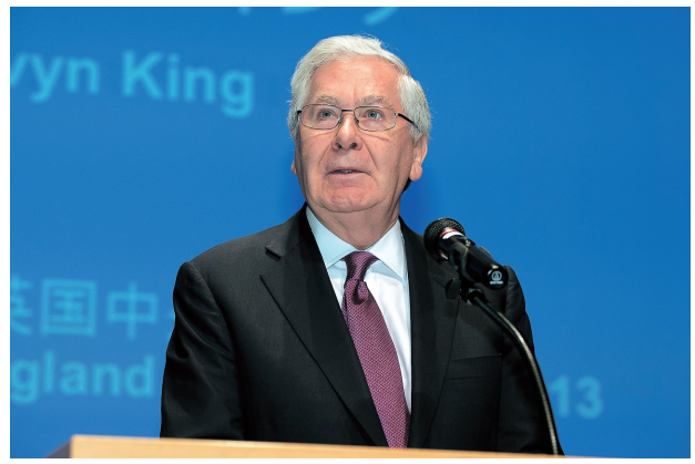
Lord Mervyn King at the 2015 Forum