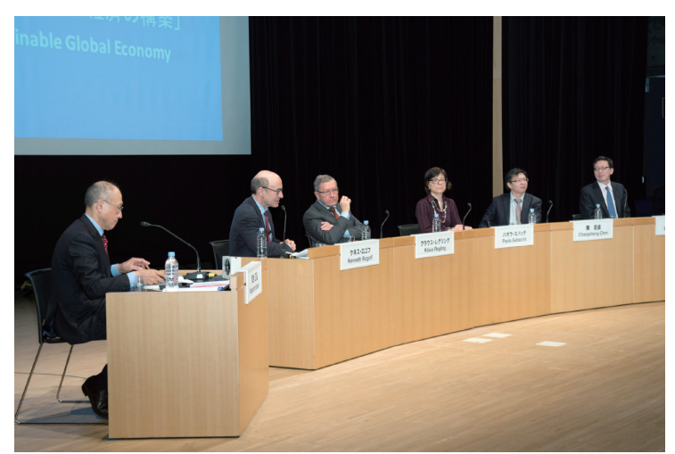
Panel Discussion at the 2015 Forum

The World Economy program carries on the work of the former Tokyo Club Foundation for Global Studies in funding research, conferences, and publications on the global macro economy and capital market development.