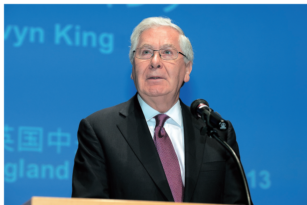
Lord Mervyn King at the 2015 Forum