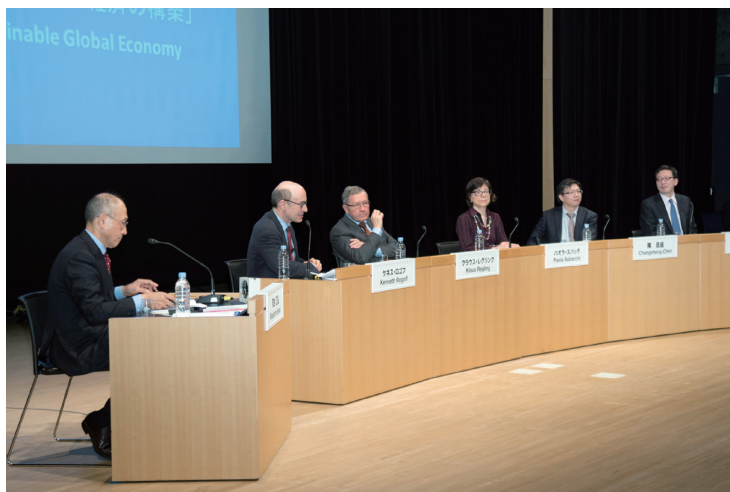
Panel Discussion at the 2015 Forum

The World Economy program carries on the work of the former Tokyo Club Foundation for Global Studies in funding research, conferences, and publications on the global macro economy and capital market development.