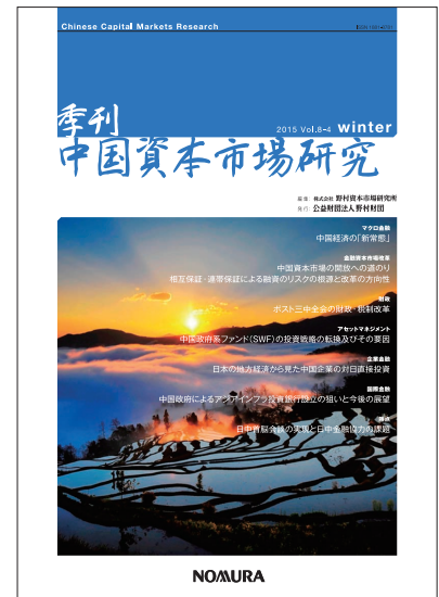
Cover of Chinese Capital Markets Research