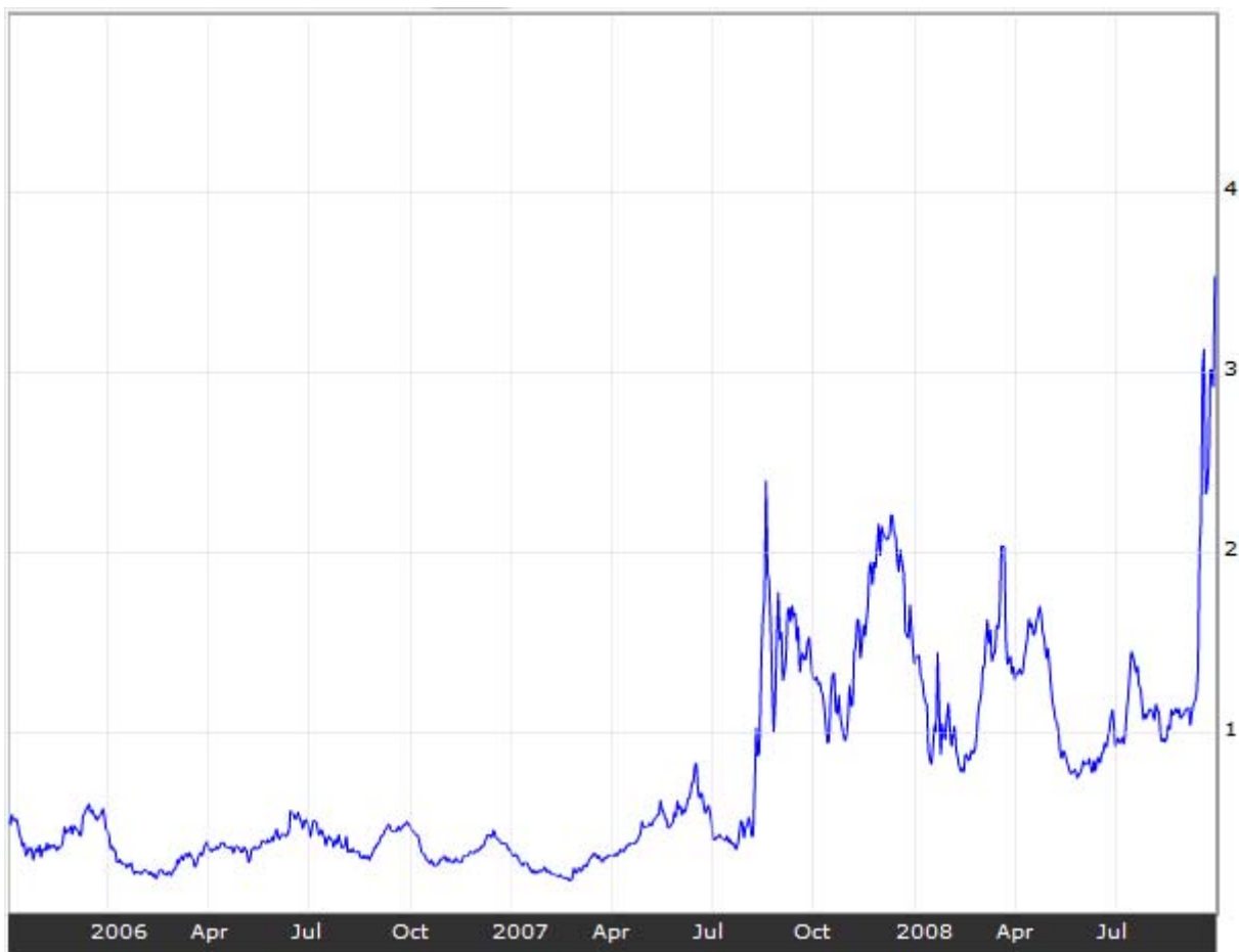
Figure 1: Spread between 3-month LIBOR and 3-month Treasury bills (TED spread, in percent) over the last 36 months (3Q 2005 – 3Q 2008), Source: Bloomberg

And then there is the indirect channel of contagion, following from the dramatic rise in CDS spreads and lending rates in the interbank market where lending rates reached record levels for an extended period, and markets became shallow. For some institutions, like Bear Stearns and Northern Rock in March 2008 and Lehman Brothers in September 2008, interbank lending became virtually impossible, experiencing a run on its reserves 1 at the same time. While Northern Rock was bailed out and Bear Stearns was taken over by JP Morgan Chase subsidized by the government, Lehman Brothers went bankrupt. This indirect channel mainly affected institutions with strong reliance on interbank lending, investment banks in particular. Extremely high levels of LIBOR over risk-free rates (see Figure 1) and an unprecedented small supply of funds in the interbank market forced banks to boost their liquidity reserves. The write-downs of their asset portfolios diminished the banks' equity capital and forced them to raise capital from investors, including Sovereign Wealth Funds.